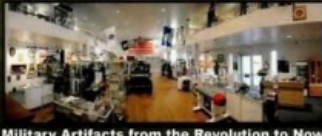
Military Artifacts from the Revolution to Now

WWW.VETERANSMEMORIALCENTER.ORG FACEBOOK.COM/VETERANSMEMORIALCENTER