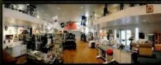
Military Artifacts from the Revolution to Now

WWW.VETERANSMEMORIALCENTER.ORG FACEBOOK.COM/VETERANSMEMORIALCENTER