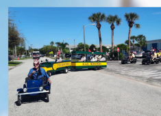
2025 Cape Canaveral Veterans Day Parade